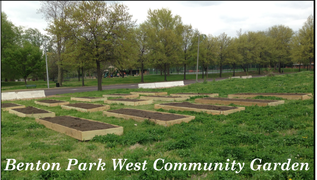
Benton Park West Community Garden

Feel free to drive or walk by and checkout the progress in the garden.